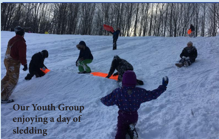
Our Youth Group enjoying a day of sledding