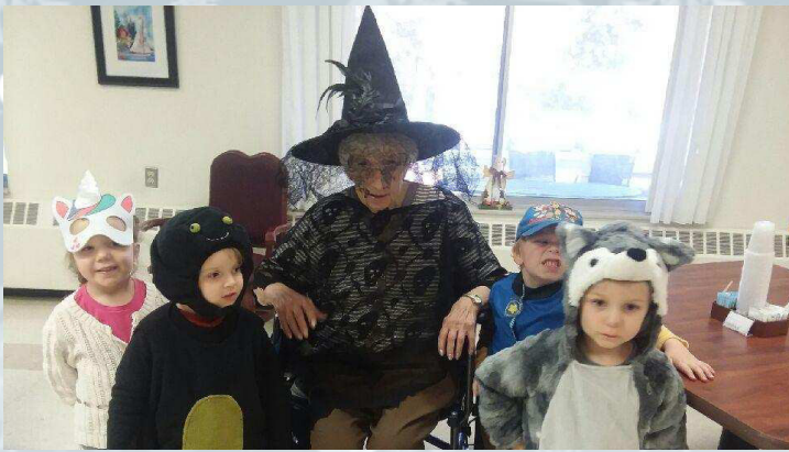
The Preschoolers walked up to Jennie Bl Richmond Nursing Home to visit with residents and trick or treat!