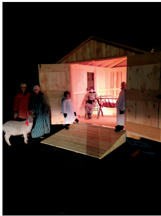
Drive Thru Living Nativity